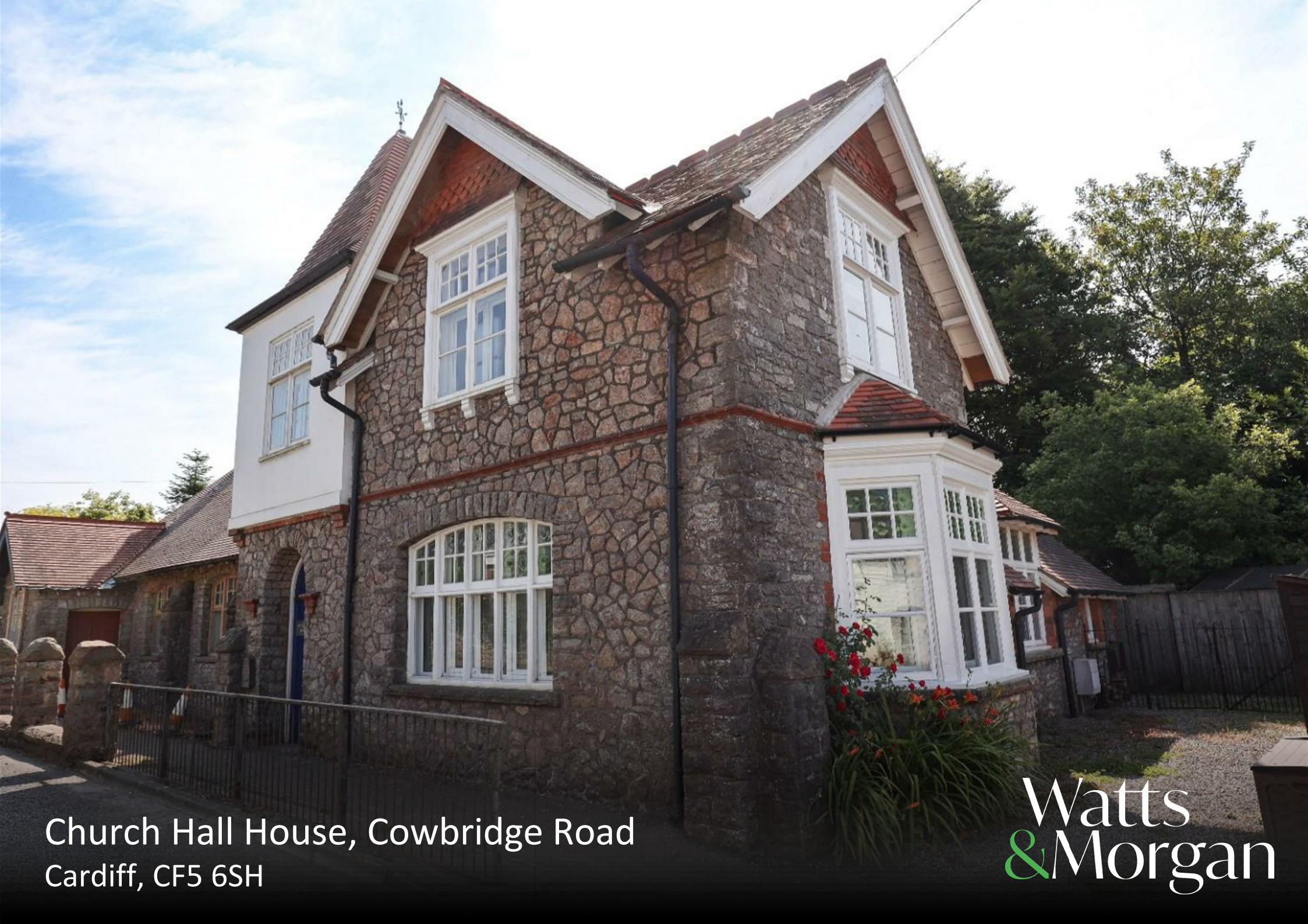
Church Hall House, Cowbridge Road Cardiff, CF5 6SH